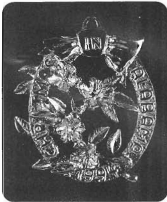
Actual Size 2-1/4" x 2-1/2"

Polished Pewter $9.95 Gold overlay $14.95